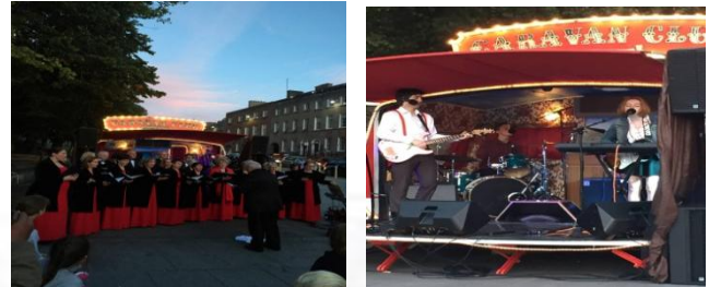
The Caravan Club Extravaganza on the Parade