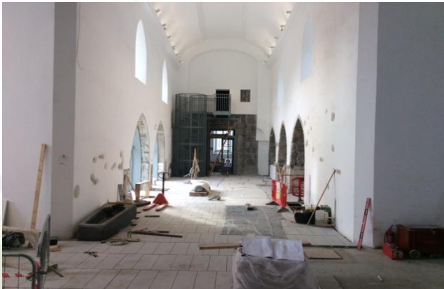
Image below shows progress inside.

Internal works nearing completion. St. Mary's Medieval Mile Museum is moving steadily towards completion. External archaeological works reaching conclusion and onsite services restored. Project remains on course for audio visual fit out during November.