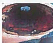
Condition of old water main

Later in the year Kilkenny County Council will recommence the upgrade of footpath works on the left hand side of the street as you approach the traffic lights.