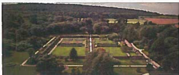
Aerial view of the Walled Garden

Preparations are well underway for the Entente Florale in Inistioge in July 2018. After a difficult Spring, ground conditions remained poor into May. However, new planting of shrubs and trees, removal of fallen trees and repair of grounds in Woodstock is now almost complete with planting of new beds and improvements to signage also underway. The tea shop in Woodstock is now open seven days per week and the busy tourist season is already evident with increases in visitor numbers to the gardens.