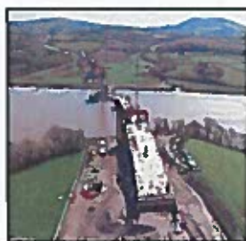
Barrow Bridge – View from Kilkenny side.