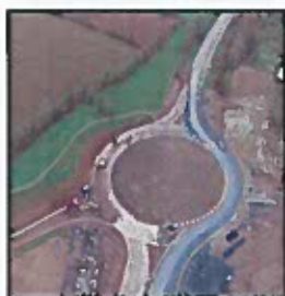
Works at Glenmore Roundabout in preparation for full opening under temporary traffic management

The full circulatory roundabout will be operational under temporary traffic management for this phase which is anticipated to be in place until July. The L7513 Ballyverneen Road will also re-open in the coming weeks. Also on the Kilkenny side, the bridge deck for Ballyverneen Overbridge is under construction and Glenmore Underbridge is nearing completion. Works on the railway overbridge to carry the disused Waterford to New Ross rail line is also progressing.