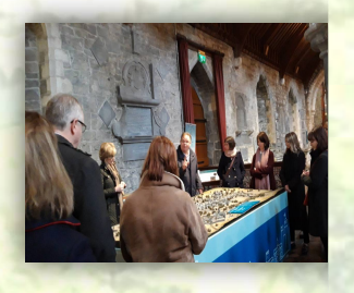
Fam Trip: Ireland's Medieval Mile, Kilkenny, 15th January 2019