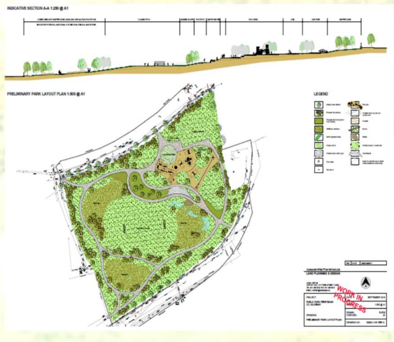
Ferrybank Park and Playground Proposed Layout

Tenders for this specialist play contract have been received for the Park and the successful tenderer is expected to be notified by end of June. The Park will be funded by a combination of LIHAF funding (Local Infrastructure Housing Activation Fund) with match funding from Kilkenny and Waterford Local Authorities.