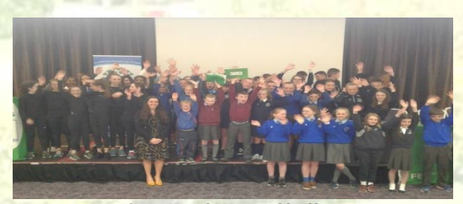
Stop Food Waste Challenge

The following is a table of the schools who achieved Green Flag Status and the theme they worked on: -