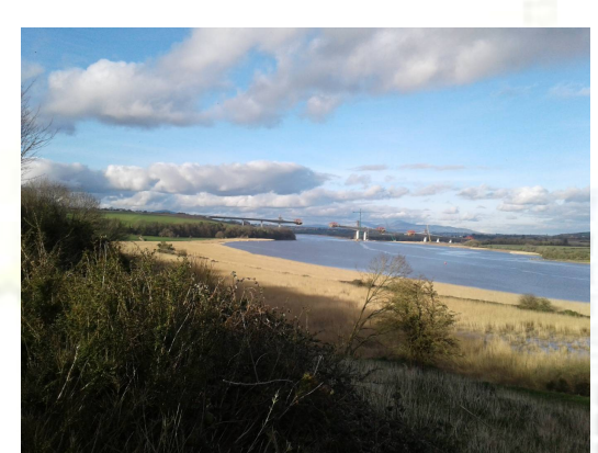
View from Carrickcloney of the route of the proposed Greenway to the New Ross By-Pass Bridge

Following submission of the application for funding and the visit by the project assessment board in April, a funding announcement is expected imminently. In the meantime, the Parks Department is working closely with Wexford County Council and Malachy Walsh and Partners Consultants in preparing the detailed design for the route. This process has commenced and consultation with landowners and other stakeholders to design accommodation works where lands or properties interface with the proposed Greenway has begun.