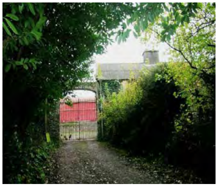
Entrance gates to farmyard