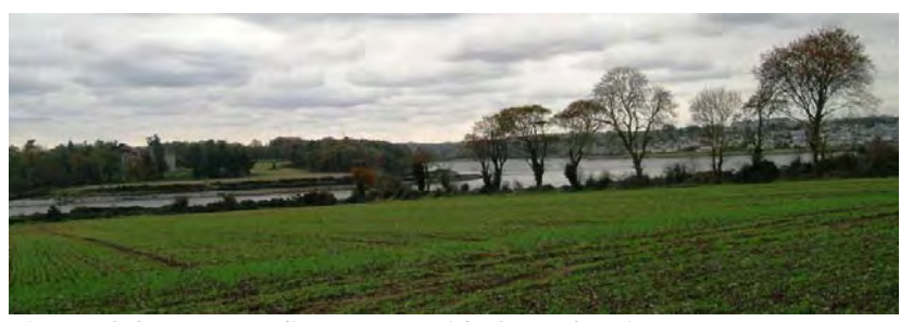
Views of the surrounding countryside from the site

The outbuildings, although in very poor condition, are reasonably intact. The remains of a single storey house, possibly once a gate lodge, can be seen at the entrance to the site. The site runs down to the River Suir, offering spectacular views of the surrounding countryside and of Waterford Castle.