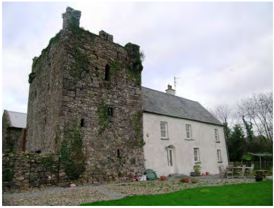
Tower & domestic house