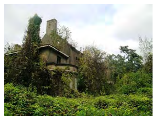
Ruins of the Glasshouse

The Glasshouse, an early 18th century house, was occupied until the early 1990's, but has since fallen into a state of neglect. The Port of Waterford is now located in direct proximity to this house; hence much of its original setting has been obliterated.