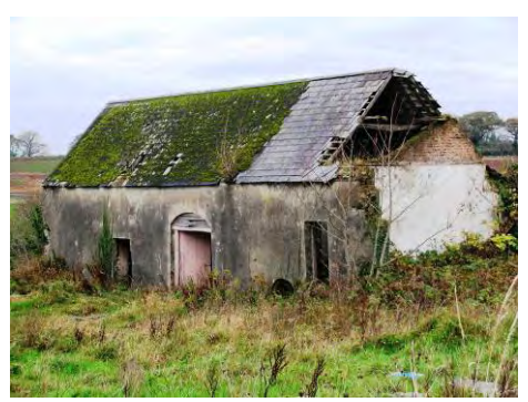
Remains of outbuilding

Townland: Mullinabro RPS: Mullinabro C370