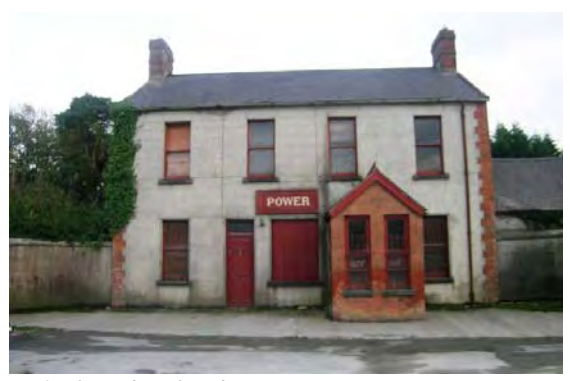
Main façade of pub

This is a pleasing architectural example of a traditional village pub. A modest structure of unassuming architectural aspirations, this pub is a reminder of the social interaction and community development of bygone years. Currently disused, the building is in good condition and retains much of its early fabric. It would appear that the upper floor was used for residential purposes and that entry to the pub was through the porch. This porch contains pleasing decorative details such as the sash windows, bargeboard, iron finials and simple signage, enhancing the overall appearance of the building.