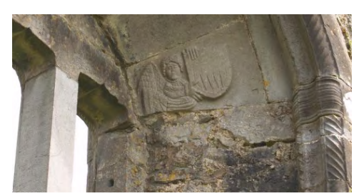
Decorative internal stonework

A late 14<sup>th</sup> century tower-house with later elements including a 17th century oriel window. It was partially restored in the18th century. Beside the tower is a medieval two-storey hall, and the whole is surrounded by a curtain wall. There are still some remnants of the rich decorative stonework that went into the building of the castle. It is now a National Monument.