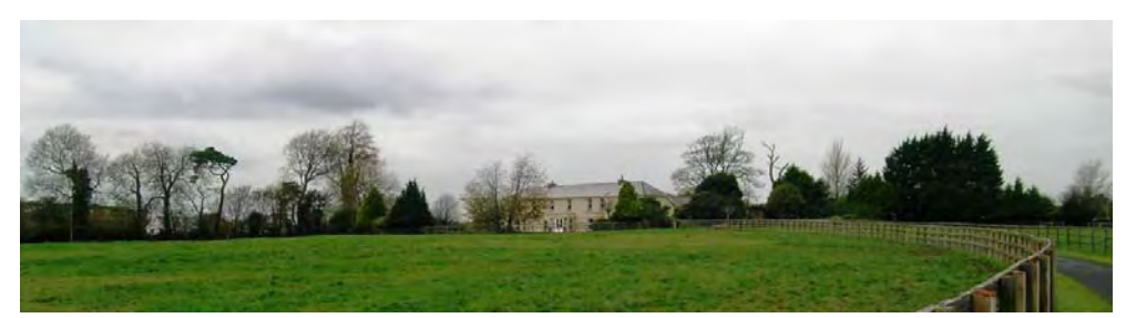
House and Entrance Avenue

Although this house has been substantially refurbished with a new roof, render, entrance porch and new windows, it appears to retain its original form and setting. Reference to the 1<sup>st</sup> edition OS map (1839-1842) indicates that the present house on this site corresponds to the original Larkfield House in terms of the building outline and setting. Substantial quantities of early fabric have been lost as a result of renovation; however, there are a number of stone outbuildings to the rear, which along with the fine entrance avenue and entrance gates, add character to the setting of this house.