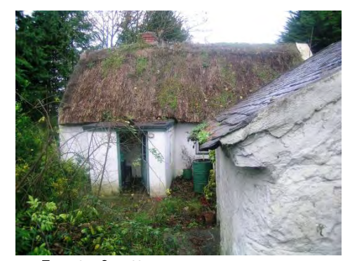
Side of cottage