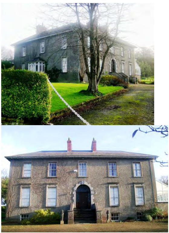
View of house from avenue