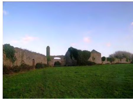
Entrance to courtyard