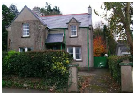
Mavis Bank house

This house is an attractive, well proportioned structure (late 19<sup>th</sup> century). The retention of original sliding sash windows, circular cast-iron downpipes and the attractive entrance porch enhance the appearance of the house further. The shouldered architrave to the dormer window and gabled breakfront adds interest to the façade of the house.