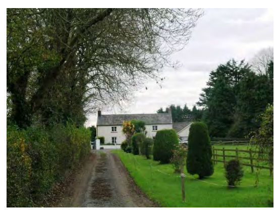
View of farm house from the road