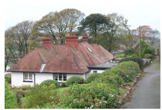
Rear of house

Late 19<sup>th</sup> – early 20<sup>th</sup> century house built in the Arts-and-Crafts-style. Notable features include the clay roof tiles and the red brick chimneys. The entrance to this house features an attractive set of iron gates.