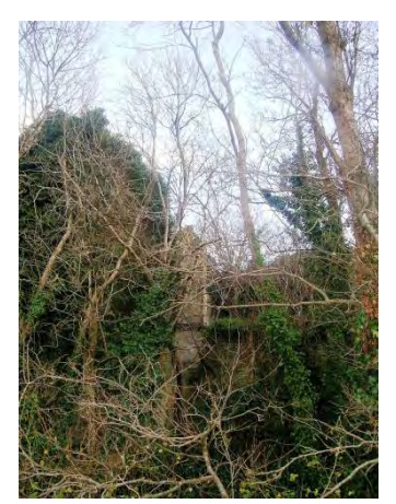
Ruins of Mill

Ruinous shell of a grain mill, which once stood as a 5-storey structure. Formerly, it had two waterwheels, but is now devoid of machinery. It is currently overgrown with tress and is in a very dilapidated condition.