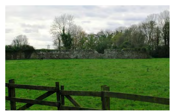
Stone wall remains in adjacent field