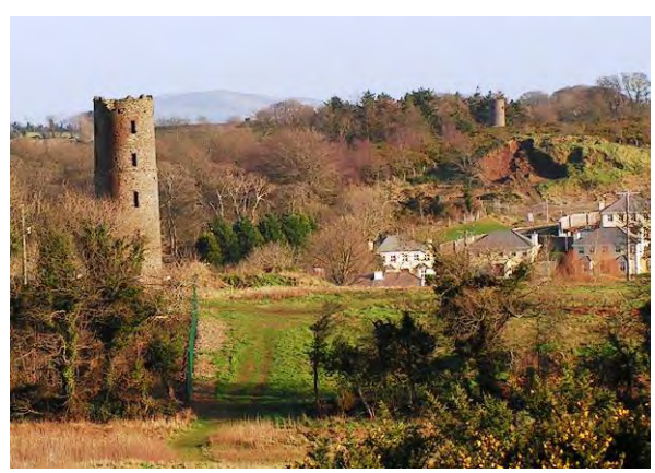
Watchtowers at Ferrybank

The tower in the foreground of photograph is located off the Rockshire Road, while the second tower is situated at the summit of Rockshire Hill. Both towers are two-storey, roofless and circular in shape. Both were constructed as watchtowers during the Napoleonic period (late 18<sup>th</sup> century –early 19<sup>th</sup> century).