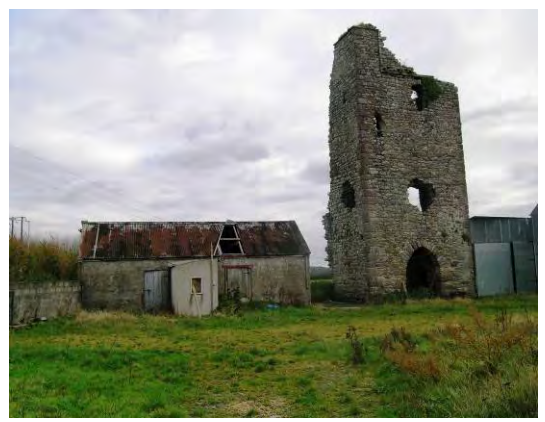
Remains of gate house

All that remains of the original Gorteens castle complex today is a late medieval gate house. The upstanding ruin of this gate house is composed of random coursed stone walls with sandstone quoins to the corners. It is in a reasonably intact state and makes a strong visual impact on the surrounding landscape, occupying a prominent site at the junction of two roads. The site at which it is located contains the ruins of a domestic house and farm-buildings. These structures detract somewhat from the setting of the medieval gate house.