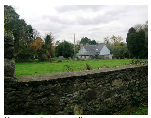
House and stone wall

Gyles Quay appears to be the original setting of Snowhaven House (see OS map below) with the present complex retaining many early architectural features such as stone walls, iron gates, entrance piers, and attendant outbuildings. The existing house on the site appears to be a later addition and has been refenestrated in recent years. The setting of this house is greatly contributed to by the farmyard and woodland. Although the house itself is only of modest architectural character, the complex as a whole has a charming historic appeal.