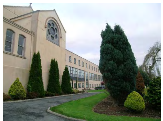
Church & new development alongside