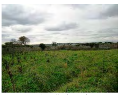
Remains of Walled garden

Remains of walled garden and outbuildings that originally served Prospect House (18<sup>th</sup> century, now demolished). The walled garden, now in a ruinous state and overgrown with greenery in parts, comprises random coursed stone walls with brick dressings to openings.