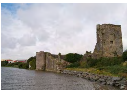
Castle overlooking the River Suir