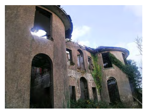
Ruins of Springfield House

Ruins of Springfield House (18<sup>th</sup> century). The original setting of the house is now lost and a waste water treatment plant is currently being constructed on the site. Only the shell of the house remains, with all the openings now blank. Despite its ruinous condition, it is still an impressive structure, with the bows to either end of the façade adding to its elegance.