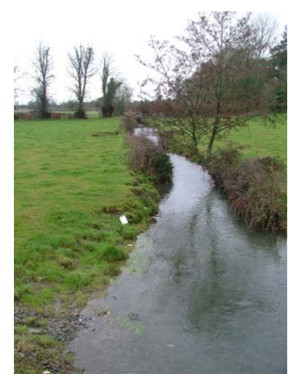
Photo 2: View of Small Stream to the north of the town - a tributary to the Barrow.

Photo 1: View along High Street towards Bridge Street, with gradual descent to River Barrow.