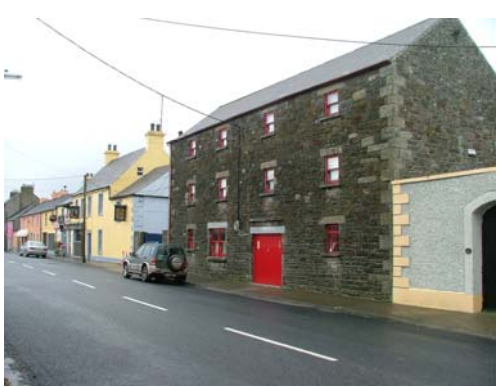
Photo: A focal site is a site that is the focal point of a prominent vista or view along a particular street. They are frequently found on corner sites and road junctions. The treatment of such sites is critical to good streetscape design and a visitor's first impression of a place. Buildings should be individually designed to respond to the characteristics of its In the first example, the site. building is discreet but its role is underplayed, whereas in the second example, the building has a greater townscape presence; note also how its façade responds to both streets it fronts onto.

Photo: Attractive traditional shopfront, well proportioned, with appropriately scaled nameplate and lettering. Note also how additional brand signage is limited and thereby complements rather than detracts from the premises. Traditional timber sash windows are also in keeping with the character of the structure.