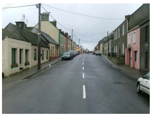
Photo 5: Streetscape view of Bridge Street typified by rather uniform building lines, terraced developments and a tight urban grain (reflecting narrow plot widths). Note variation in building heights.