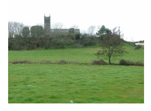
Photo: The Church of Ireland sits on an embankment north of the town.

Photo: Barrack Street is distinguished by a broadness – with ample space for onstreet car parking and street trees.