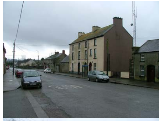
Photo 6: View along Barrack Street – note variation in scale and height of buildings.

Photo 5: Streetscape view of Bridge Street typified by rather uniform building lines, terraced developments and a tight urban grain (reflecting narrow plot widths). Note variation in building heights.