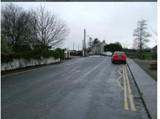
Plate 7: Chapel Street – characterized by public/institutional buildings, undeveloped sites and variations in building setbacks. The urban design quality of the street is not as well developed as other streets in the town. Note lack of footpath, to left of photo.

Photo 6: View along Barrack Street – note variation in scale and height of buildings.