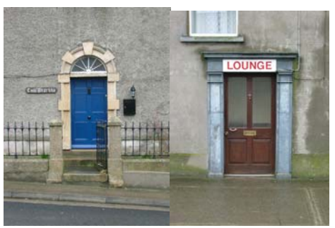
Photo (Far left): Attractive Doorway with fanlight over door and stone surround.

Photo: The Church of Ireland sits on an embankment north of the town.