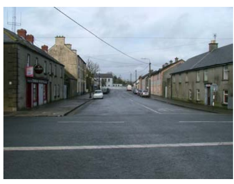
Photo: Barrack Street is distinguished by a broadness – with ample space for onstreet car parking and street trees.

Photo: View of attractive stone cottages on Barrowmount Street.