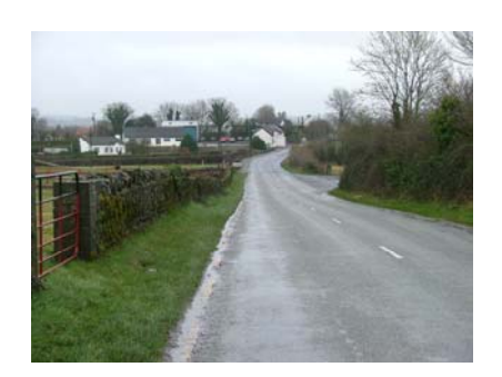
Photo 3: Approach to Goresbridge along the R702 – the landscape is reasonably level.

Photo 2: View of Small Stream to the north of the town - a tributary to the Barrow.