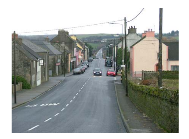
Photo 1: View along High Street towards Bridge Street, with gradual descent to River Barrow.