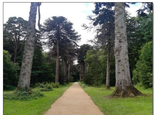
Trail restoration / enhancement – Noble Fir Avenue and Monkey Puzzle Avenue, Woodstock