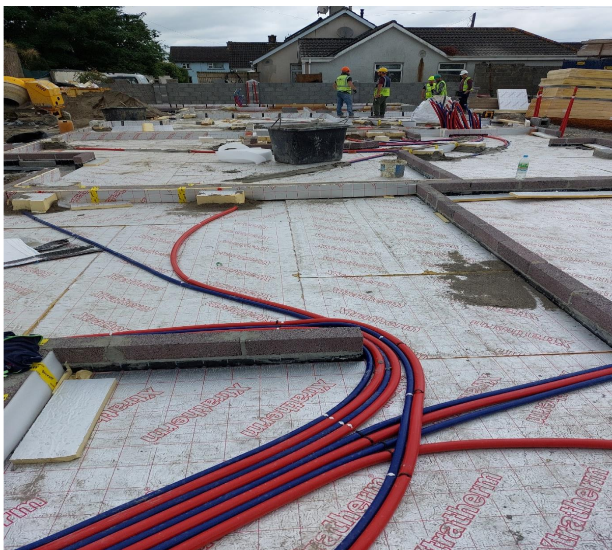
6 units at Golf Links Road – infill scheme, substructure complete