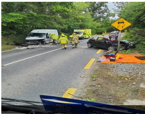
Castlecomer Fire Brigade at a recent road traffic collision

The Brigades have attended over 388 incidents to date in 2022. These incidents included a number of road traffic collisions, public road hazards, automatic fire alarm activations, chimney fires, ambulance assists.