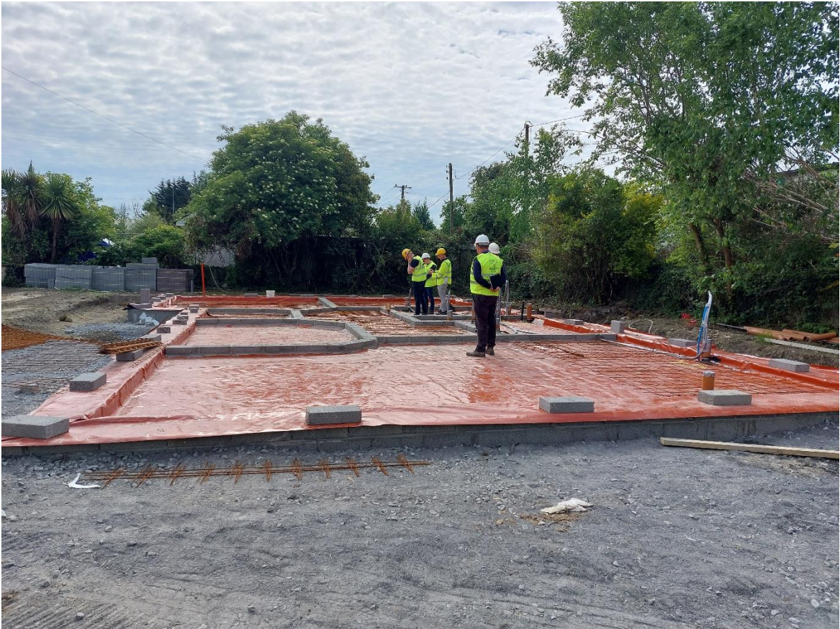
3 bed accessible house at Haggardsgreen, Callan – substructure complete