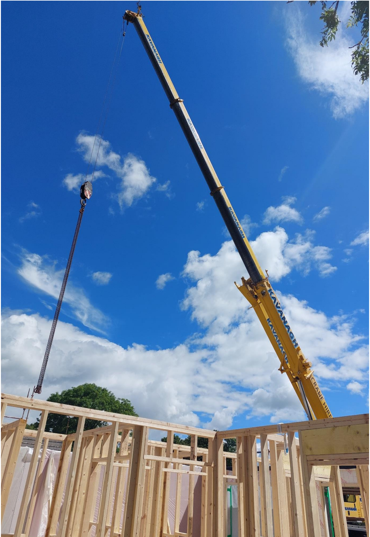
Erection of timber frame at Inchacarron Mullinavat. Low Carbon Construction.