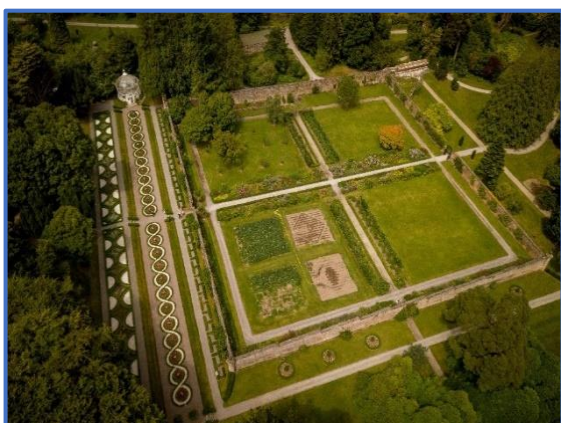
Aerial view of the Walled Garden, the herbaceous border follows the central axial path through the gardens connecting the Arboretum to the Flower Terrace

Early summer in the gardens has been busy. The Rose garden, terraces and Walled gardens have been the focus of much of the attention with topiary planting needing pruning to maintain the formal shapes typical of the Winter Garden. Also underway is the replanting of the walled garden herbaceous border and the removal of the box hedging which is unfortunately infested with box blight like so many box plants ( Buxus sempervirens ) in formal gardens all around Europe. New planting of herbaceous plants typical of the Victorian era will be planted to refresh the planting scheme.