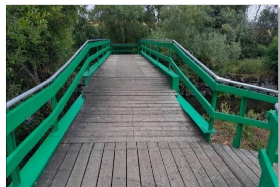
Recently completed rehabilitation to the Kings River Bridge, Kells