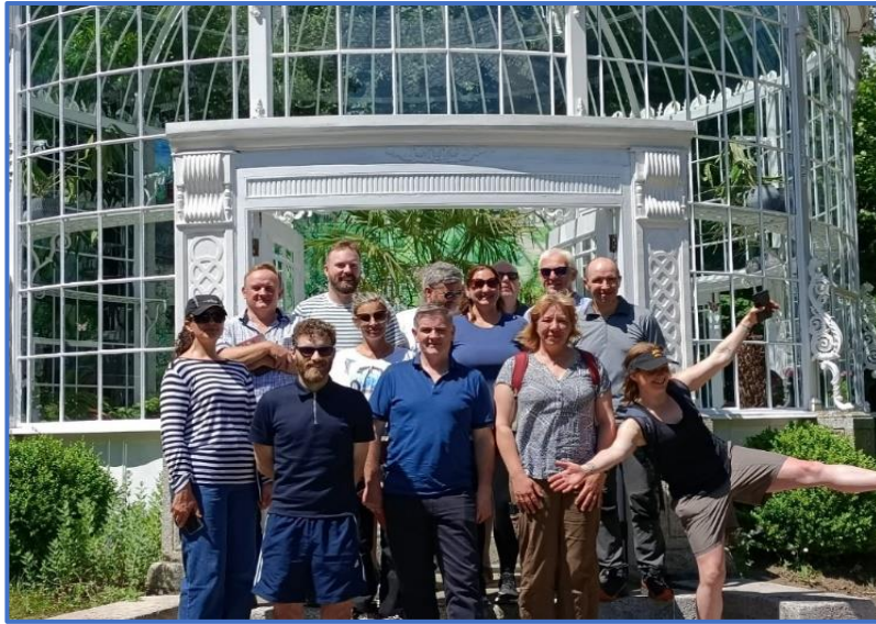
Rural Recreation Officers from all over Ireland enjoy a tour of Woodstock Gardens

A group of Rural Recreation Officers visited Woodstock Loop Walks in late June on a field trip organised by the Leader Partnerships in conjunction with the Dept of Rural and Community Development. The meeting was a great success with lunch provided for the group from all over Ireland in the Tea Rooms after a strenuous walk uphill from Inistioge village.