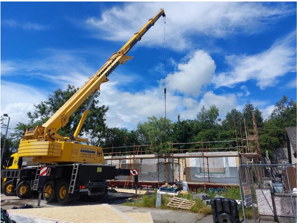
Erection of timber frame at Inchacarron Mullinavat. Low Carbon Construction