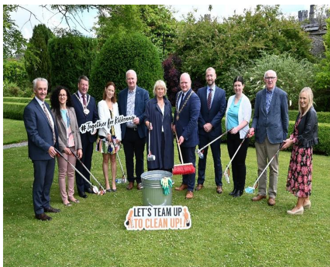
Let's Team Up to Clean Up, Together for Kilkenny Corporate Sponsor Representatives with Kilkenny County Council's Cathaoirleach, City Mayor and Representatives of the Environment Section.

5th of February 2023. Registration for both events is now open via; https://cleanup.kilkenny.ie/ .