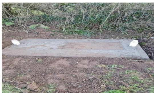
New Cover provided to existing Septic Tank following inspection

Individuals whose systems have failed inspection can contact the staff member from the Environment Section who completed the septic tank inspection or via environment@kilkennycoco.ie in order to confirm their eligibility for a septic tank grant.